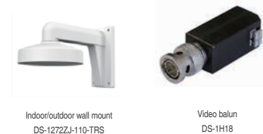
Indoor/outdoor wall mount DS-1272ZJ-110-TRS